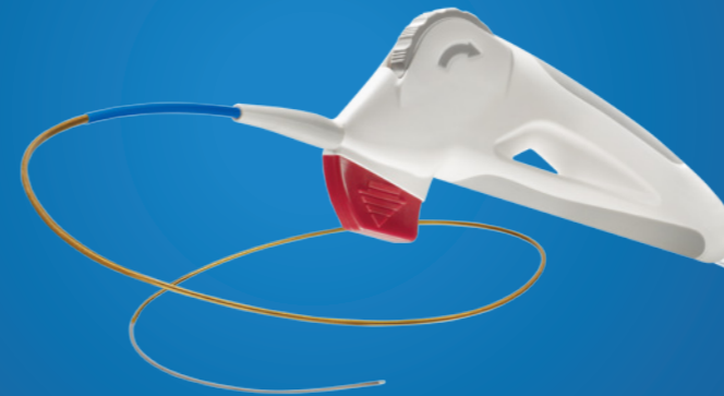
Everflex™ Self-expanding Peripheral Stent with Entrust™ Delivery System